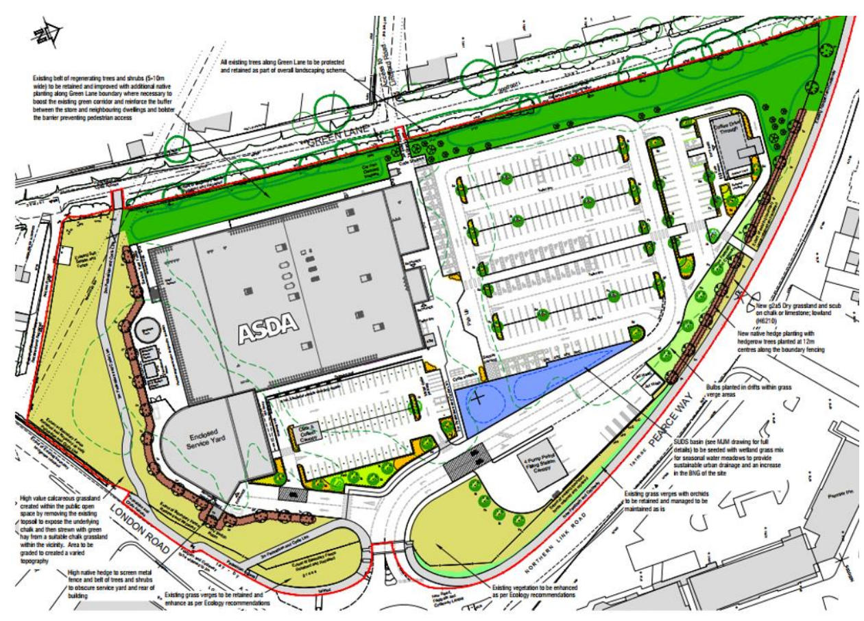
Current scheme layout