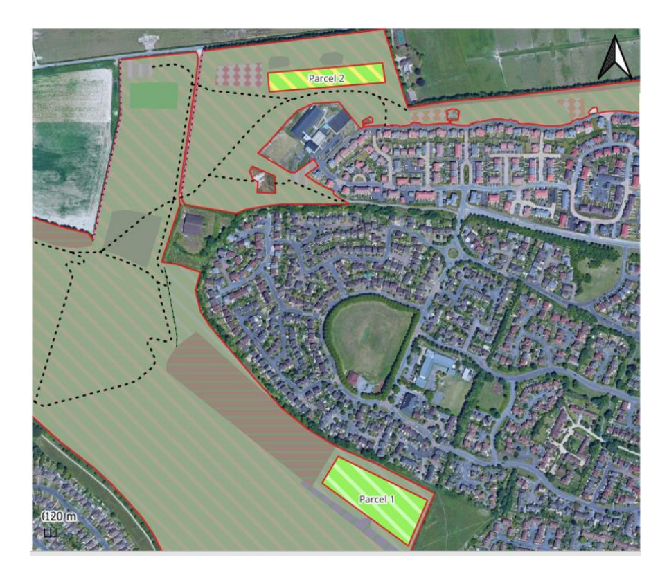
Plan showing locations of off site biodiversity at adjacent Country Park

Members should note that this current application is not subject to mandatory Bio Diversity Net Gain, and that policy CP50 only currently requires that proposals <u>demonstrate no net loss</u> of functional habitat for biodiversity in the local area. By retaining boundary features within the site and enhancing areas of the nearby country park, this requirement is fulfilled. Indeed, the <u>scheme as a whole demonstrates a net gain in excess of 10%.</u>