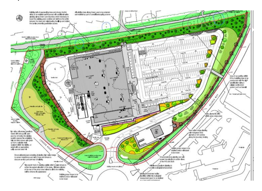
Layout of 2014 retail consent above

The land was subsequently allocated for bulky goods retail development in the 2003 Salisbury District Local Plan, and planning permission was later granted on appeal for a similar bulky goods retail scheme in 2009 (application ref S/2007/1460 refers). This permission was subsequently renewed by later applications for modifications to the scheme until April 2015. The site was then subject of the most recent planning consent for a retail store, petrol station and car park (referred to in this text as the "2014 retail consent"). This consent (se plan below) was not implemented and lapsed in 2020.